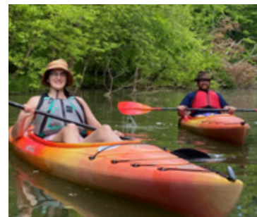
GET OUT ADVENTURES